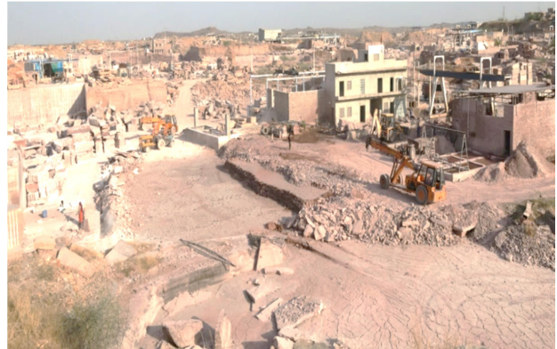
Fig. 4: Due to automated procedures including drilling, crushing, screening and blasting, etc., noise level is much higher than the recommended limit. Moreover, Workers who use pneumatic tools like drills can get vibration illnesses.

Mechanized operations like drilling, crushing, screening, blasting, and so forth cause noise levels to be far higher than the suggested noise threshold of 90 dB(A). Consequently, neurosensory deafness causes occupational hearing loss in mine workers exposed to high noise levels. There have been reports of noise levels during drilling reaching 115–122 dB or higher (Fig. 4). Extremely high noise levels and explosive blasts have the potential to rupture the tympanic membrane, impairing hearing at all frequencies and perhaps causing hemorrhaging into the middle or inner ear.