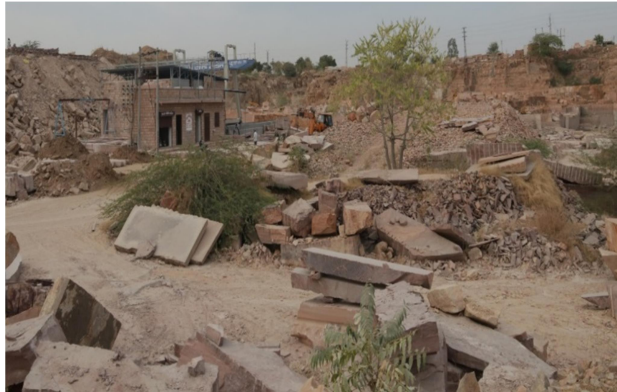
Fig. 5: The environment is affected by the mine dumps and tailings

mineral wealth while also protecting the ecosystem. One of the major sources of pollution during quarrying and transporting stone is the waste stone dust. It directly jeopardizes the health of the mining employees, because stone dust is the cause of life threatening breathing problems among the mine workers like silicosis, tuberculosis, and chest pains [34, 52- 54]. Due to wind and surface runoff, the stone dust is being deposited on the soil and crop lands. As a result, the soil quality and crop production are decreasing [49, 55].