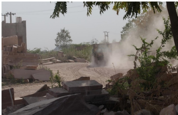
Fig. 3: Silica dust generated due to different types of mining activities. This dust reduces the lung's ability to function by causing silicosis, or the fibrosis of lung tissues.

There are 2.5 million workers engaged in mining in Rajasthan [38]. Unfortunately, most of these mines are from an unorganized economic sector [36]. Workers in the majority of the unorganized sector face dangers to their bodily and mental health due to their line of work [39] and carries an increased risk of exposure to harmful chemicals [40].