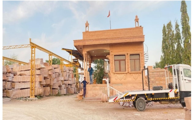
Fig. 2: Use of Sandstone as building materials – from quarried raw material i.e., slabs of sandstone (left side) to finished building of sandstone (right side).

and a craftsmanship centre in India is Jodhpur, Rajasthan. According to the Indian Bureau of Mines [33], Rajasthan used to produce about 90 % of the sandstone of India. Considering the favorable color and texture of the sandstone, Jodhpur produces a vast variety of sandstone. Sandstone from Rajasthan has been widely used because of its high quality, which includes regular bedding, consistent grain size, acceptable character, and durability (Fig. 2). It is even exported, to Canada, Japan and the Middle Eastern countries [34].