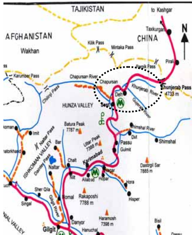
Figure 1. The map of a portion of Northern Areas of Pakistan in the Himalayan range. The present studies has been carried out in four locations at different altitudes in the dotted encircled part.

area consists of limestone of Devonian age and phyllites, slates, quartzites, marbles, schists and sandstones. The detectors placed in radon dosimeters were exposed for a period of one year.